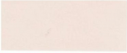
Dry CREEK DE6122

PLEASE NOTE: Paint colors appear differently on computer monitors – when specifying, always use the reference numbers shown below alongside the example color